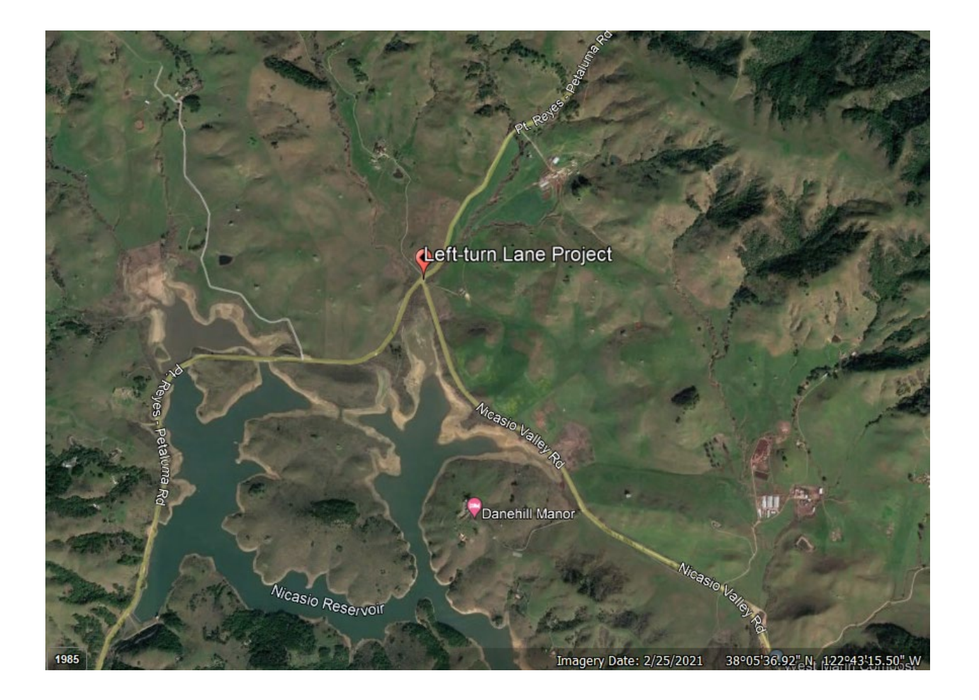
VICINITY MAP Pt. Reyes-Petaluma Rd. at Nicasio Valley Road- Left Turn Lane Project