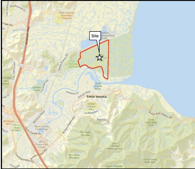
McInnis Park Approximate Location