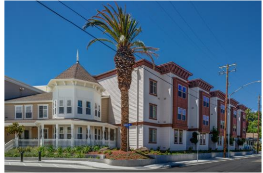
Berrellesa Palms is a model program of support for very low-income seniors with chronic health conditions, allowing them to live independently

We place an emphasis on creating unique programs for seniors, focused on healthy living and on supporting seniors in maintaining their independence. This "aging-in-place" model supports independent living for seniors as they age comfortably at home, providing activities, advocacy, and health linkages that are catered to both healthy seniors and those with special needs. RCD provides these services through an on-site service coordinator who partners with other local service providers.