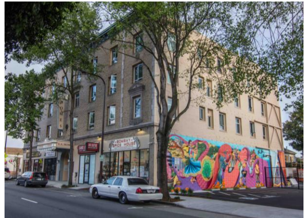
Built in the 1920's, UA Homes was recently rehabilitated and restructured for long-term operating success

RCD's Asset Management team ensures long-term sustainability through strong fiscal controls over the RCD portfolio. RCD has consistently improved year-over-year performance of the portfolio over the past six years. In response to RCD's continuing growth and expanding housing portfolio, RCD expanded its Asset Management department to include a Director of Finance. The Director of Finance is responsible for ensuring the financial strength and economic performance of RCD and its existing properties consistent with the financial, physical and social goals, standards and requirements of RCD and its funders.