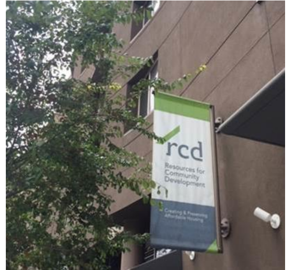
Three commercial spaces, including RCD's headquarters, form the street level retail at Oxford Plaza

This growth is fueled by our proven capacity to develop projects on time and on budget, and through the relationships we have forged and maintained with local governments, lenders, investors and neighbors over the years. Always looking for innovative ways to meet our goals, RCD was an early adopter of green and sustainable building practices and a pioneer of the integrated housing approach to special needs.