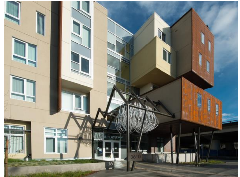
The Ambassador incorporated public comment throughout the design process

Ambassador Housing development. Public input was solicited through a series of large public meetings and smaller group and individual meetings over a period of three months. After incorporating input from a Redevelopment Agency meeting, a public neighborhood-wide meeting, individual and group discussions after these meetings, and individual conversations with residents on the phone, the RCD team submitted its initial concept design for review by Planning staff and the Planning Commission in July, 2009. RCD also staffed an information table and did outreach at the local elementary school at Back to School Night to solicit input from prospective families that might become residents at the development in the future.