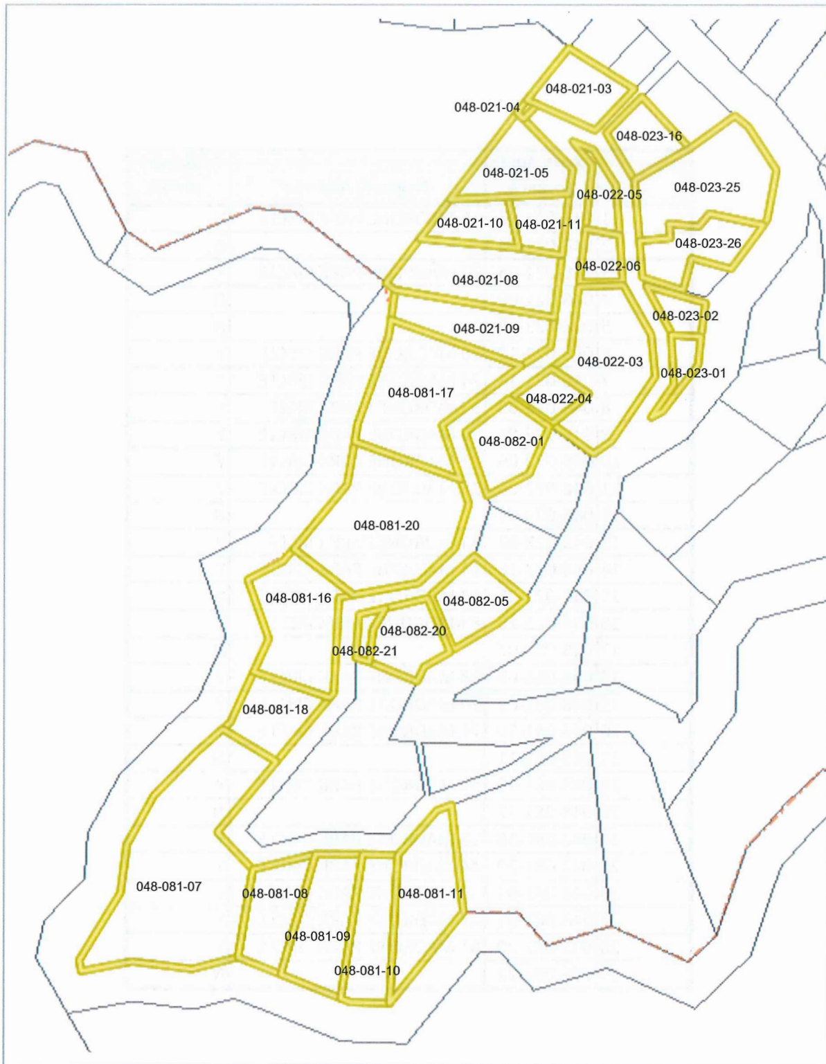
EXHIBIT A: BOUNDARIES OF THE MADRONE PARK CIRCLE PERMANENT ROAD DIVISION